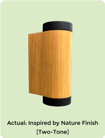
Actual: Inspired by Nature Finish [Two-Tone]