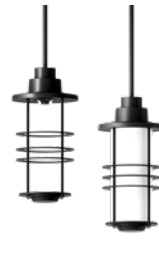
Forrey 32 Ø12.5"/10.5"