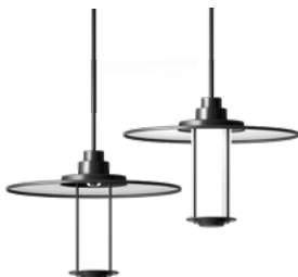
Forrey 27 Ø34.6"