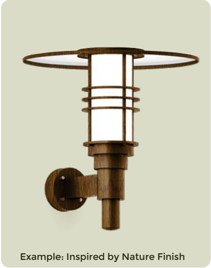
Example: Inspired by Nature Finish