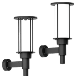
Forrey 23 Ø12.5"