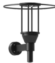
Forrey 33 Ø20"