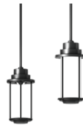
Forrey 29 Ø9.8"/8.8"