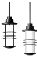
Forrey 32 Ø12.5"/10.5"