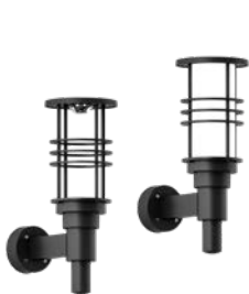
Forrey 22 Ø6.3