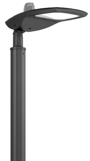
LIGHCONNECT IoT Ready Billund