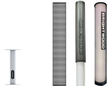
A20691 Root Mount Kit