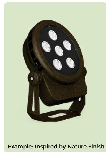
Example: Inspired by Nature Finish