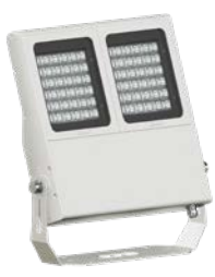
PH Painted Hardware

THERE IS AN ADDITIONAL COST FOR THESE FINISHES