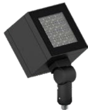
Lador 4 TKM