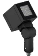
Lador 2 TKM