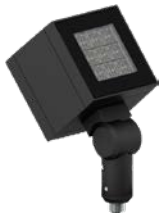
Lador 3 TKM