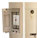
A91591 Lockable In Use GFCI Receptacle Outlet Box