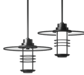
Forrey 28 Ø34.6"