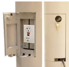
A91591 Lockable In Use GFCI Receptacle Outlet Box