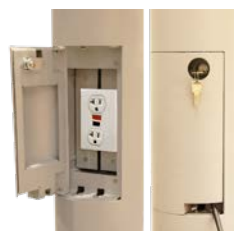
A91591 Lockable In Use GFCI Receptacle Outlet Box

Additional Options (Consult Factory For Pricing)