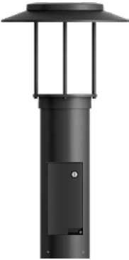
A91591 Lockable In Use GFCI Receptacle Outlet Box