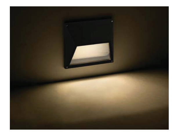
Ordering Example: UEC - 40267 - HPS-70w - 120v - Options