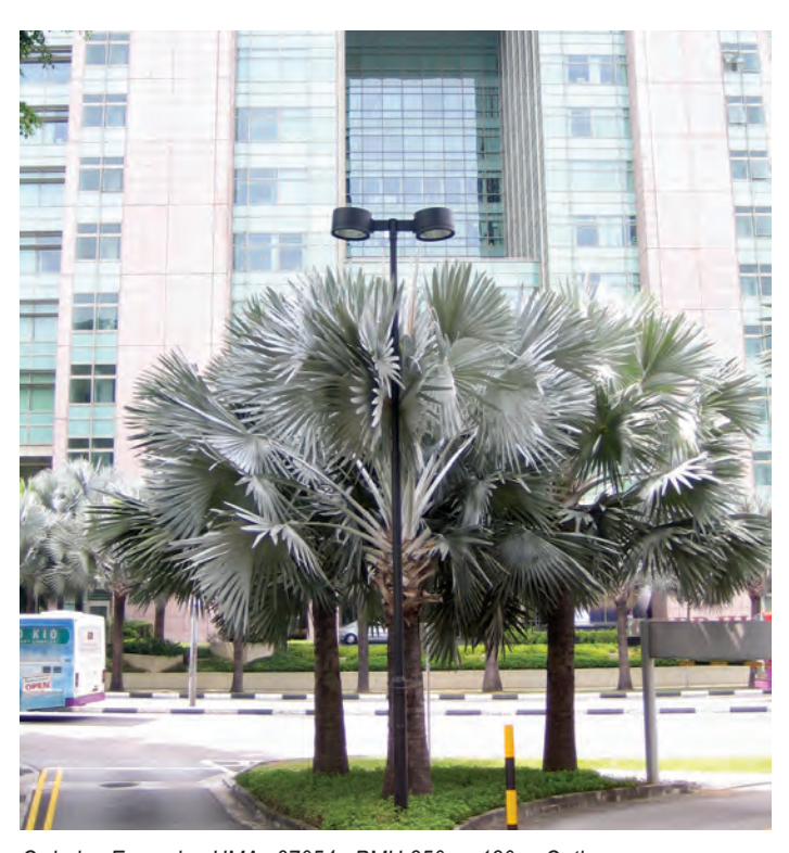
Ordering Example: UMA - 97054 - PMH-350w - 120v - Options