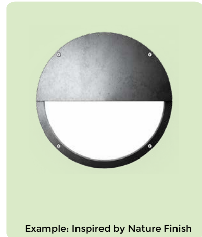
Example: Inspired by Nature Finish