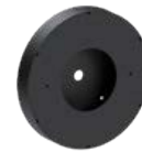
SCDT Surface Conduit Decorative Trim

NOTE: This decorative trim does not function as a junction box. Wire connections should be made inside the luminaire