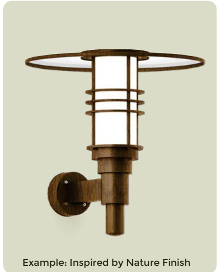
Example: Inspired by Nature Finish