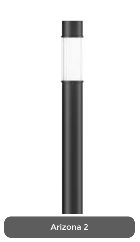
• UAR-20973-39w-3657lm • UAR-20974-37w-3697lm