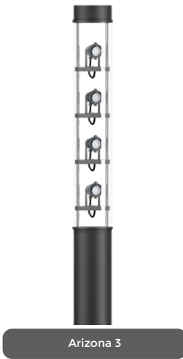
• UAR-20991-50w-4396 lm