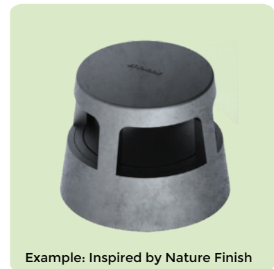
Example: Inspired by Nature Finish