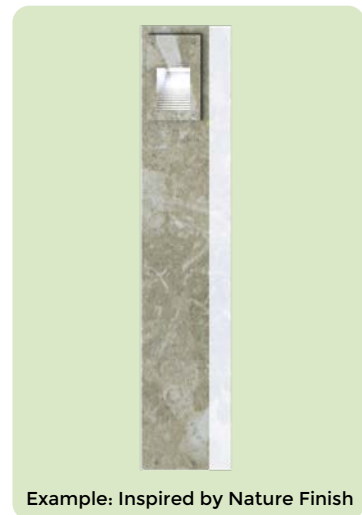
Example: Inspired by Nature Finish